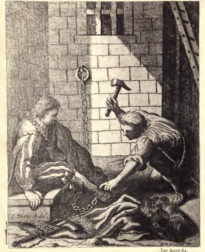
See page 64.