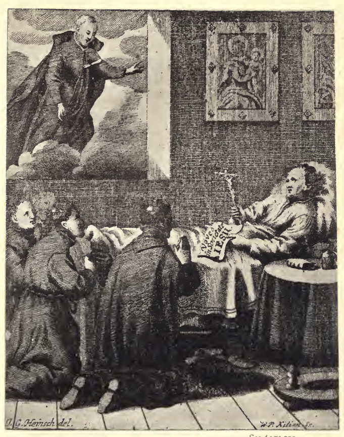
See page 202.