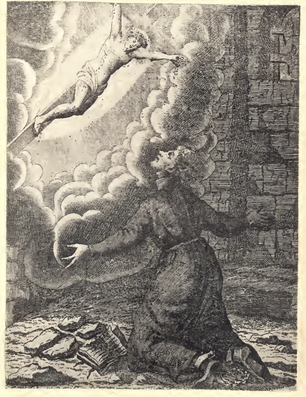
See page 220.