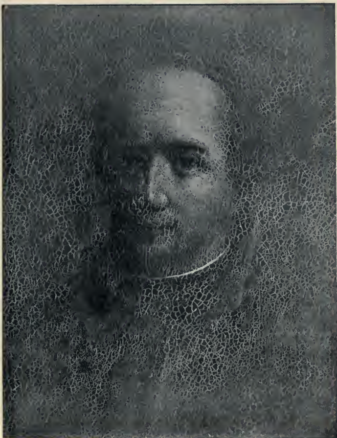
ALLEGED PORTRAIT OF JACQUES MARQUETTE, S.J.

[Photo-engraving from oil portrait, by unknown artist, discovered in Montreal in 1897. See note 51, present volume.]