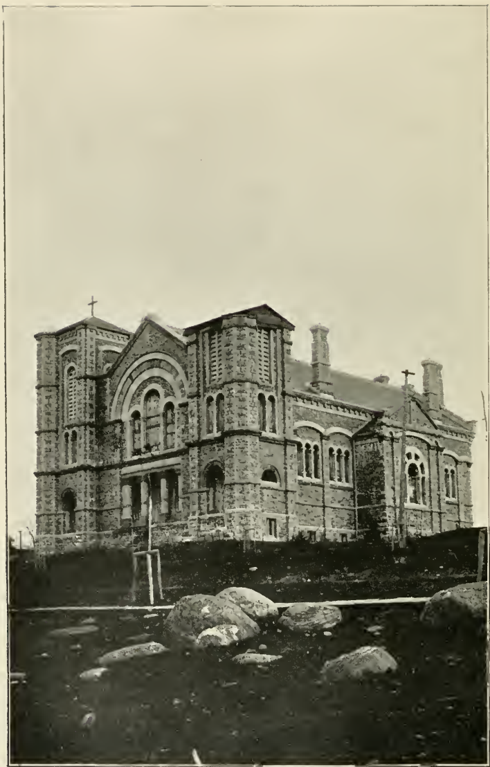
MEMORIAL CHURCH AT PENETANGUISHENE, ONT.