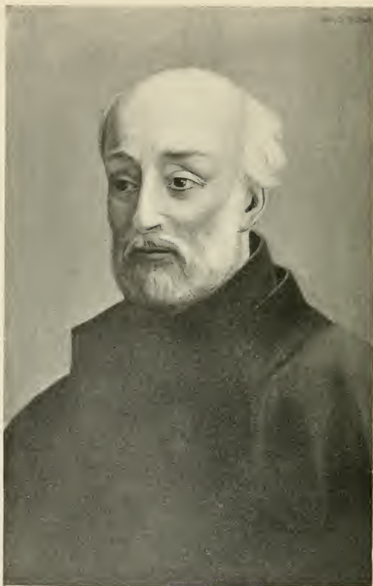
PAUL LE JEUNE, S.J.