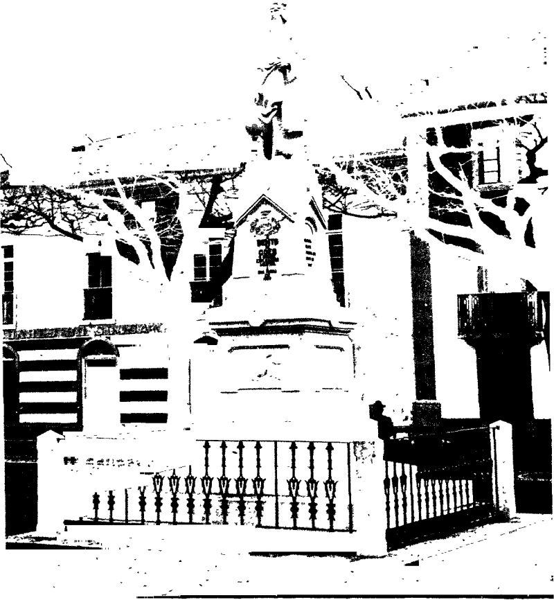
Statue of Bento de Goes at Villa Franca do Campo—Azores.